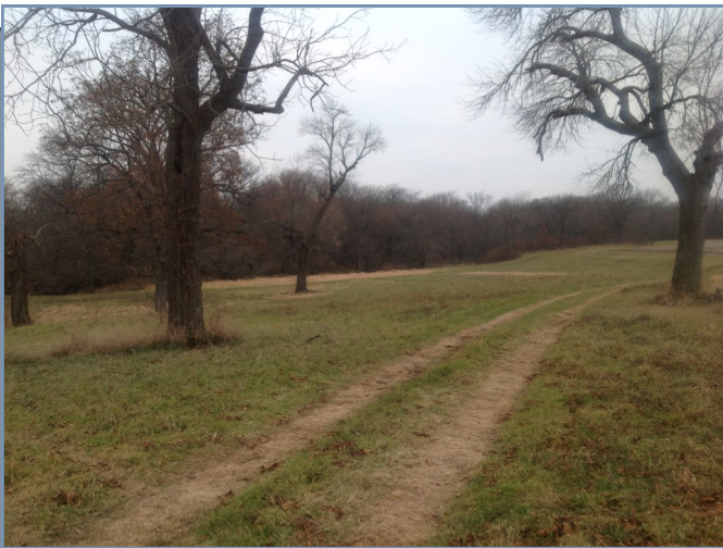
Tract 2, east of the waterway