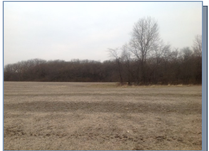
Tract 2, west of the waterway