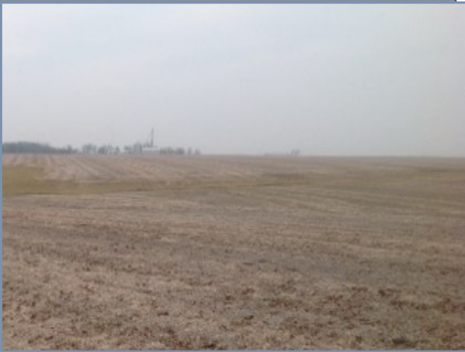
Southwest side of Tract 1 looking north