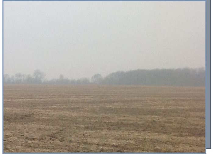
East side of Tract 1 looking west