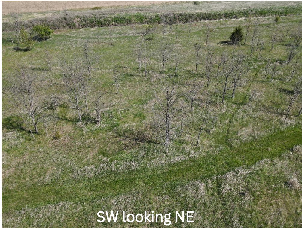
SW looking NE

PFORR FARM - CHAMPAIGN COUNTY, IL 19.30 +/- TAXABLE ACRES