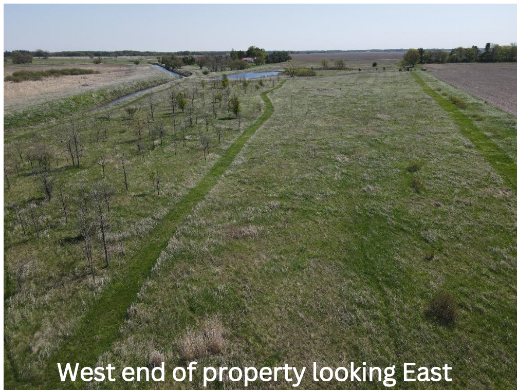
West end of property looking East