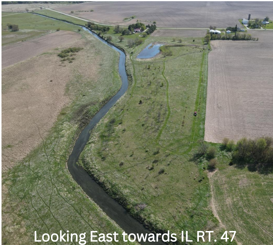
Looking East towards IL RT. 47

PFORR FARM - CHAMPAIGN COUNTY, IL 19.30 +/- TAXABLE ACRES