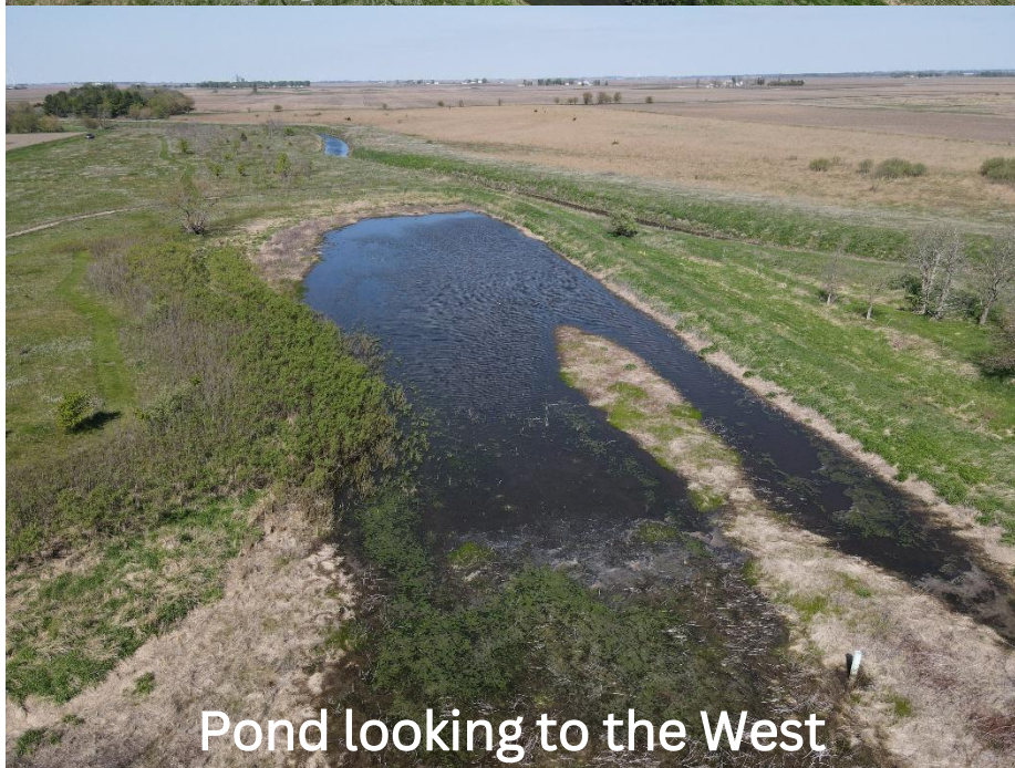
Pond looking to the West