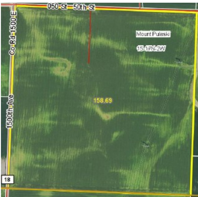
Tract # 4