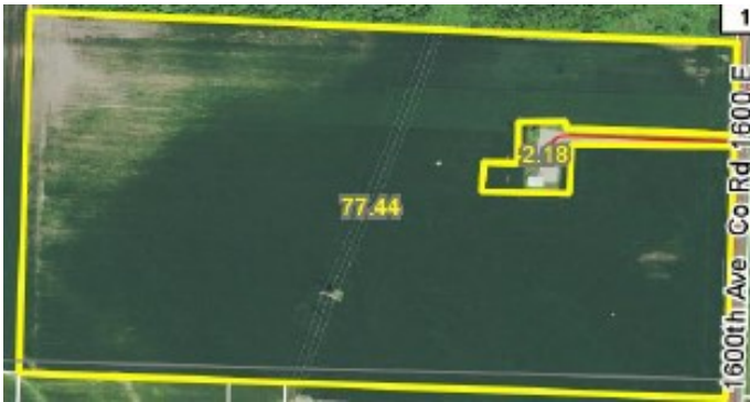
Tract # 1