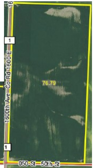
Tract # 3